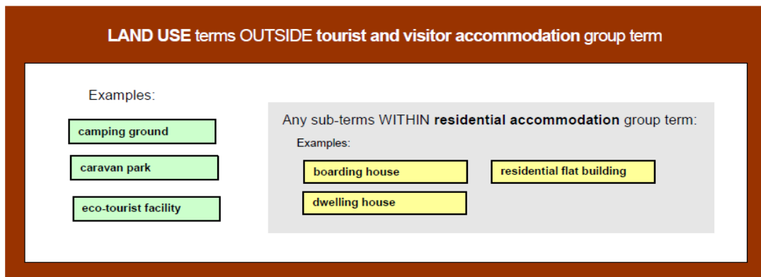
Figure E.1 General relationships between land use terms in the Standard Instrument LEP

LAND USE terms OUTSIDE tourist and visitor accommodation group term