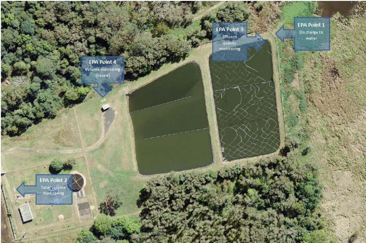
Treatment Plant EPA Points