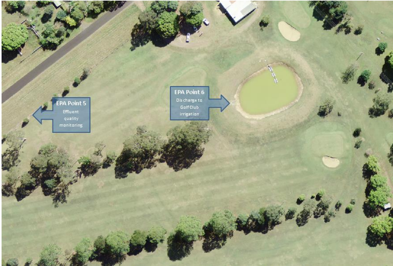
Effluent Reuse EPA Points