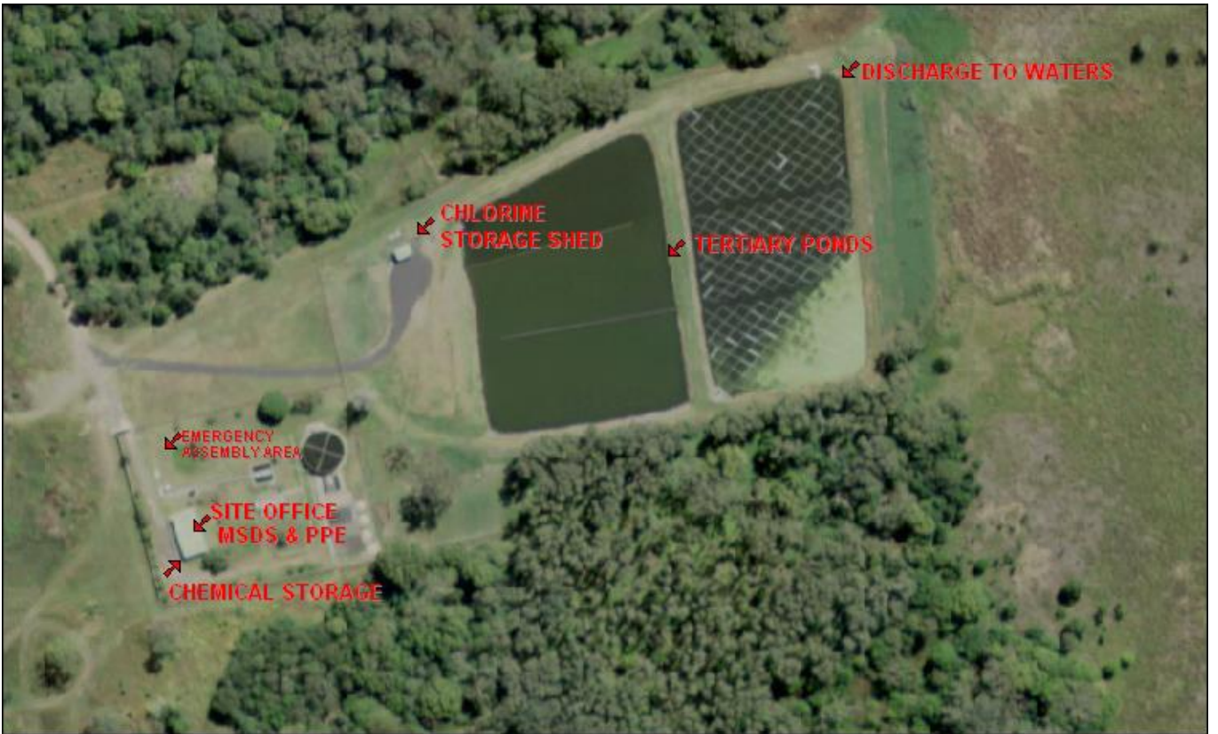
Site Plan Descriptions