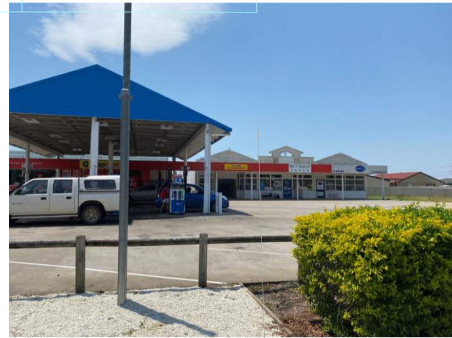
Existing Commercial Tenancies