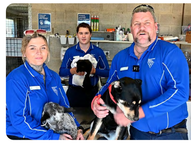
Council's ranger team looks after more than 300 stray or lost animals every year.

Our priority for the next two years will be to maintain and improve these services, while completing our ambitious flood recovery program. Key focus areas will include improving development assessment times and continuing to provide development concierge services to support our customers. We'll also continue to upgrade our business systems, utilise new technologies and improve security at council facilities. This year will also see work commence on our upgraded animal pound facility and we will continue to work with local animal welfare agencies to rehome abandoned cats and dogs.