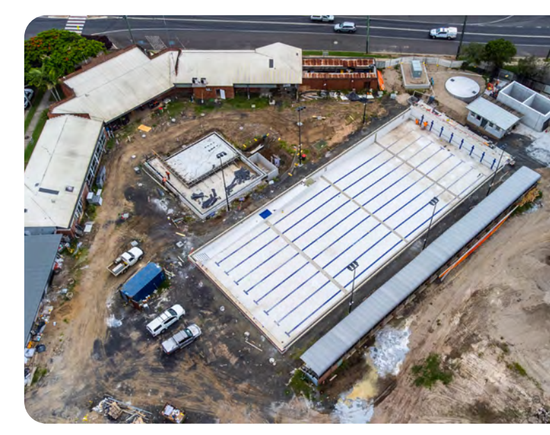
Stage 1 of the Casino Pool upgrade is nearing completion.

This year will also see the opening of the $6.7m Stage 1 Casino Memorial Pool redevelopment and Council will continue to seek the additional $10m needed for Stages 2 & 3. We'll also complete the design work to finish the Three Villages Cycleway loop, connecting Evans Head, Broadwater and Woodburn. This project will be a great boost for locals and tourists and Council is actively seeking the $6.7m required to complete the work.