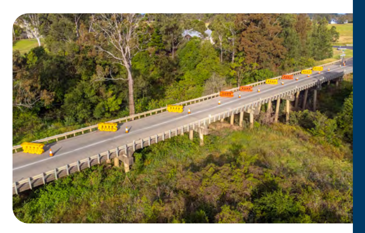
Council is actively seeking funding to replace the flood-damaged Tatham bridges.