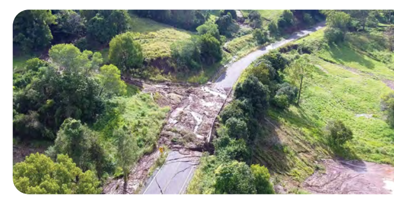
Naughton's Gap landslip restoration will begin in 2023-24.