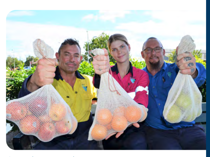
Council's waste education team promoting eco-friendly produce bags.