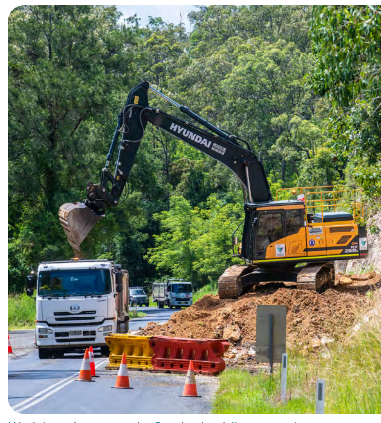
Work is underway on the Bentley landslip restoration.

The next two years will also some of our major infrastructure projects for the future beginning to take shape. This will include moving into the construction phase for Stage 2 of Evans Head Sewage Treatment Plant and undertaking the pre-construction planning and approvals for the new Casino Sewage Treatment Plant. Council will also continue to work with the Northern Rivers Reconstruction Corporation and other government partners to provide the infrastructure we need to unlock new housing developments for our community.