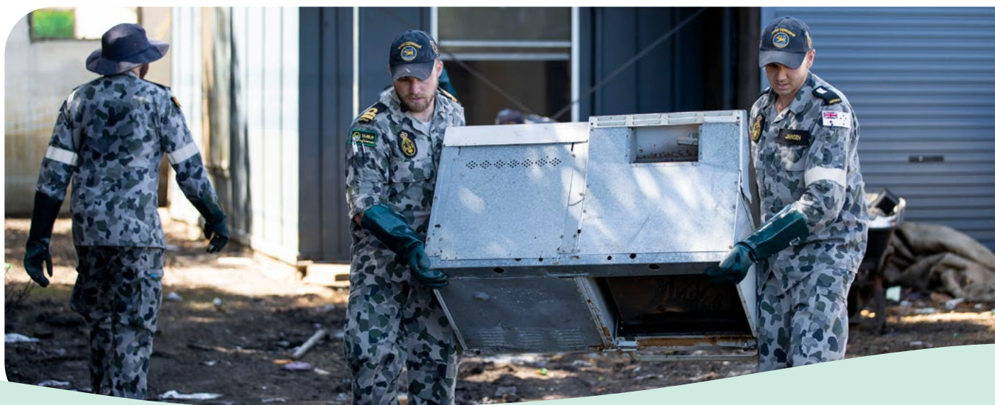
Royal Australian Navy personnel help with the flood clean up