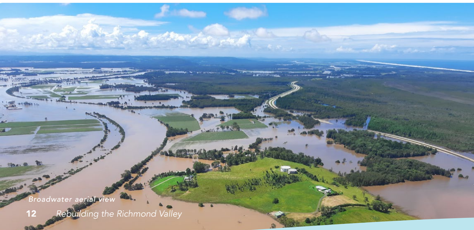
Broadwater aerial view