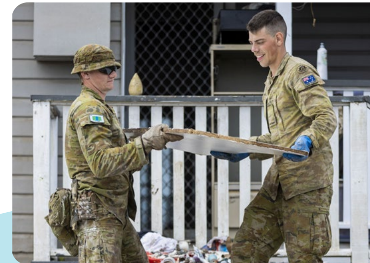
The Army helps with the cleanup in Broadwater