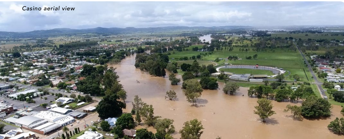
Casino aerial view