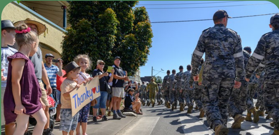
Casino's Thankyou Parade for Australian Defence Force personnel