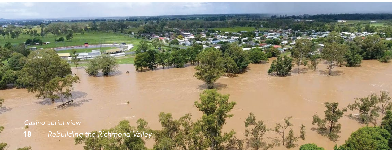
Casino aerial view