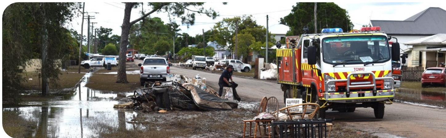
Coraki flood clean up

Council also plans a major review of stormwater drainage networks in Casino and Evans Head. Although we will always experience stormwater challenges with towns and villages located on the floodplain, there may be options to help reduce the impacts through redesign and improved stormwater management. We will be advocating strongly to State and Federal Governments to help fund the substantial cost of these studies and improvement programs. We'll also be looking at ways to make our sewerage network