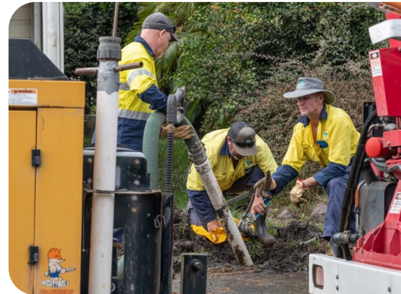
RVC work crews restoring water services at Broadwater