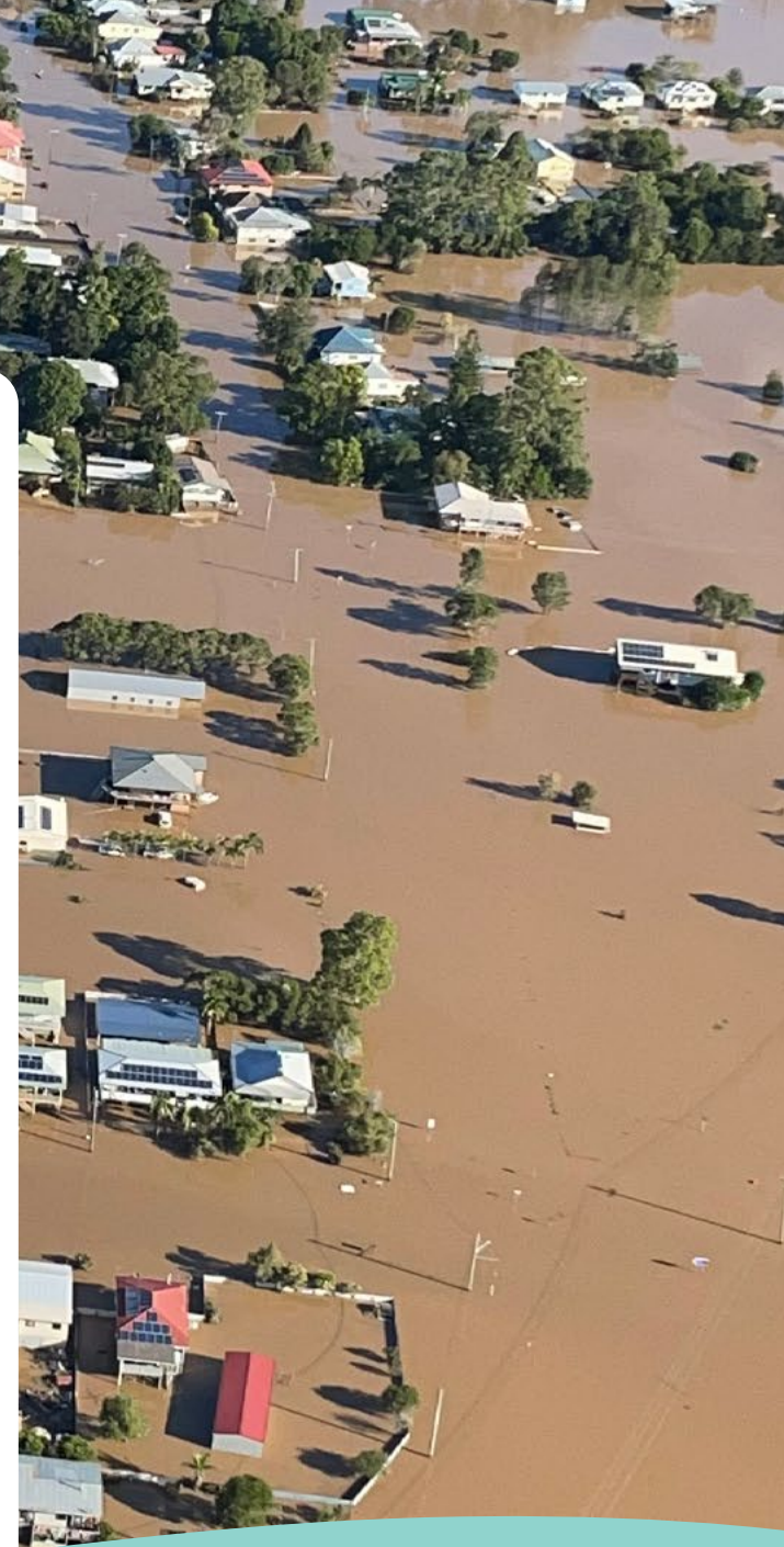
Flooding at Coraki

As the findings of the NSW Flood Inquiry are released, we will adjust this Plan, as required, to include any new opportunities or issues that arise for the Richmond Valley.