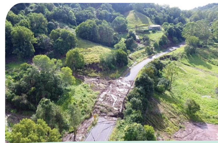
Naughtons Gap Road landslip