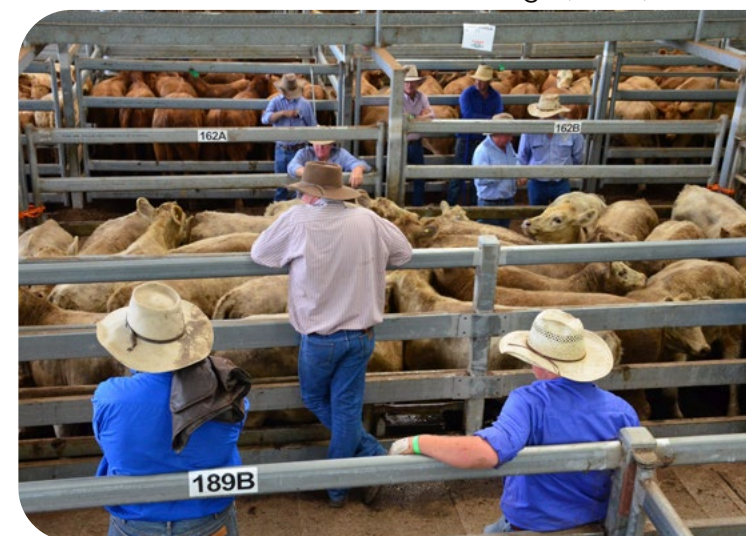
Northern Rivers Livestock Exchange (NRLX)

Council will also continue to grow its own business activities, including the Northern Rivers Livestock Exchange (NRLX) and its two quarries, to provide long-term benefits to the community and support the recovery process.