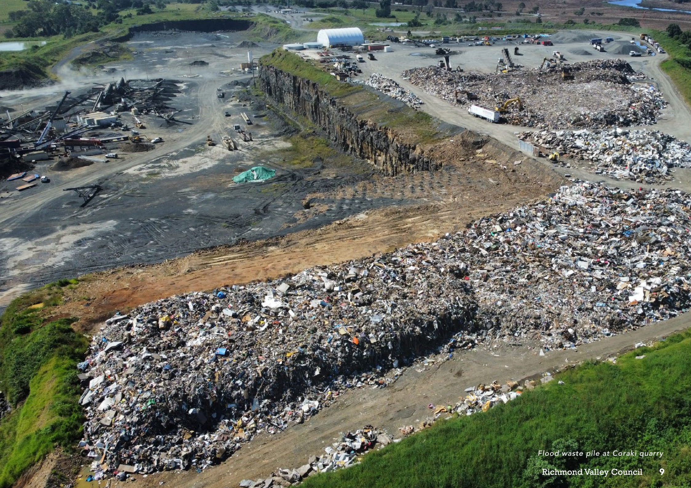
Flood waste pile at Coraki quarry