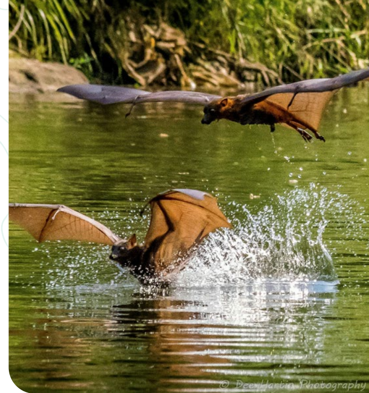
Critical flying fox roosting areas along the river have been lost

We'll also be working with the EPA to help manage pollution risks through damaged fuel tanks and chemical spills that occurred during the floods. Damaged septic tanks and other on-site sewage treatment systems will also need some attention and Council will be undertaking an inspection and improvement program for high risk sites. We'll also be working closely with Rous County Council to help prevent weed infestation from all the material carried down the river and onto our farmlands.