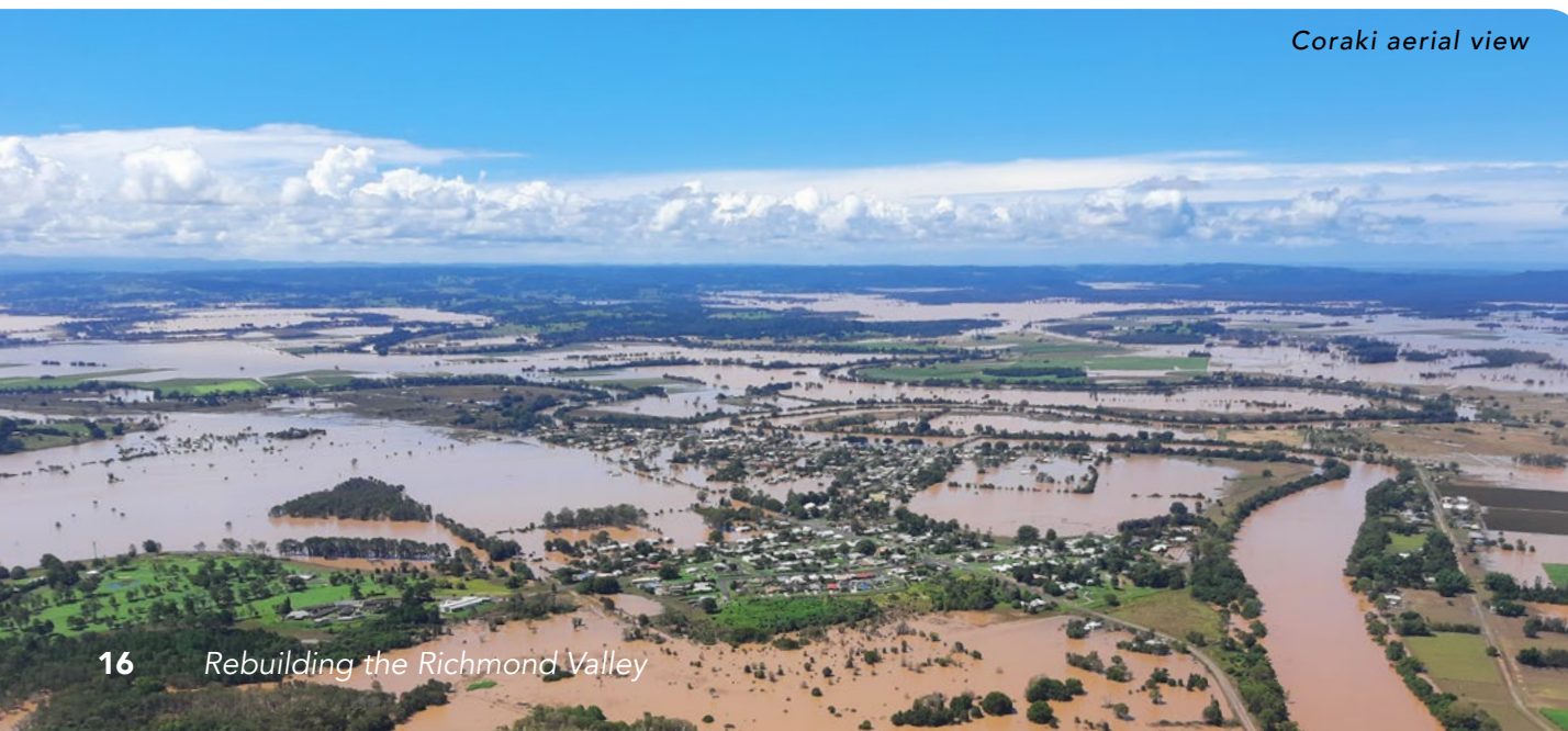
Coraki aerial view

The people of Coraki have a long journey ahead to restore and reconnect their community. Council has established a local Recovery Advisory Group to work with residents and will continue to advocate to State Government for help with essential needs, such as additional housing and health care.