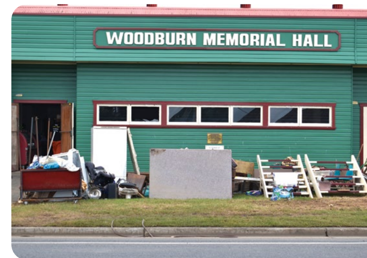
Flood damage at Woodburn Hall