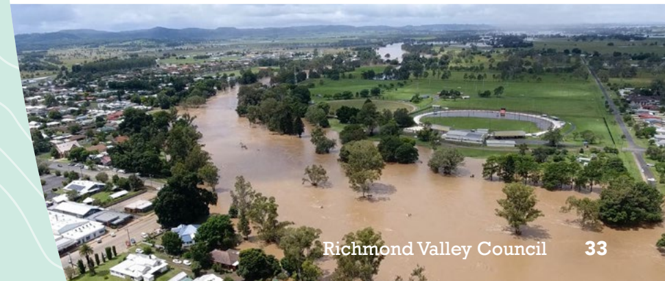
Casino aerial view