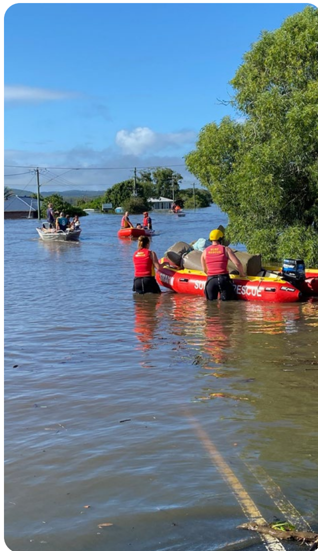
Volunteers from Evans Head help to rescue flood victims at Woodburn

In the weeks after the flood, Evans Head has become a vital hub for the recovery effort, providing much needed accommodation and services for Mid-Richmond residents who have lost their homes.