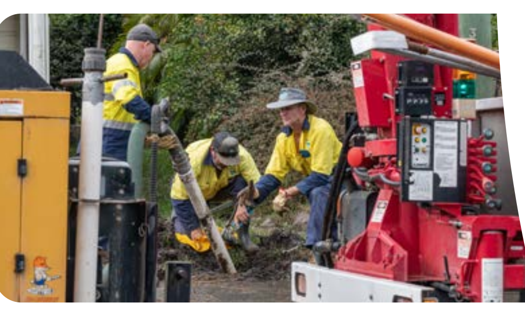
RVC work crews restoring water services at Broadwater