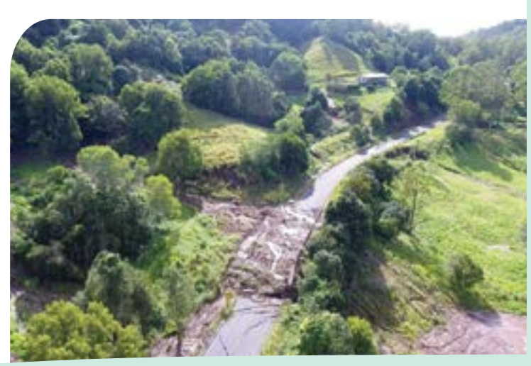
Naughtons Gap Road landslip