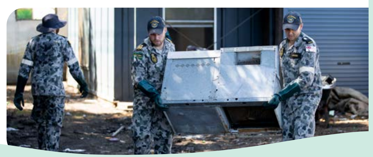
Royal Australian Navy personnel help with the flood clean up