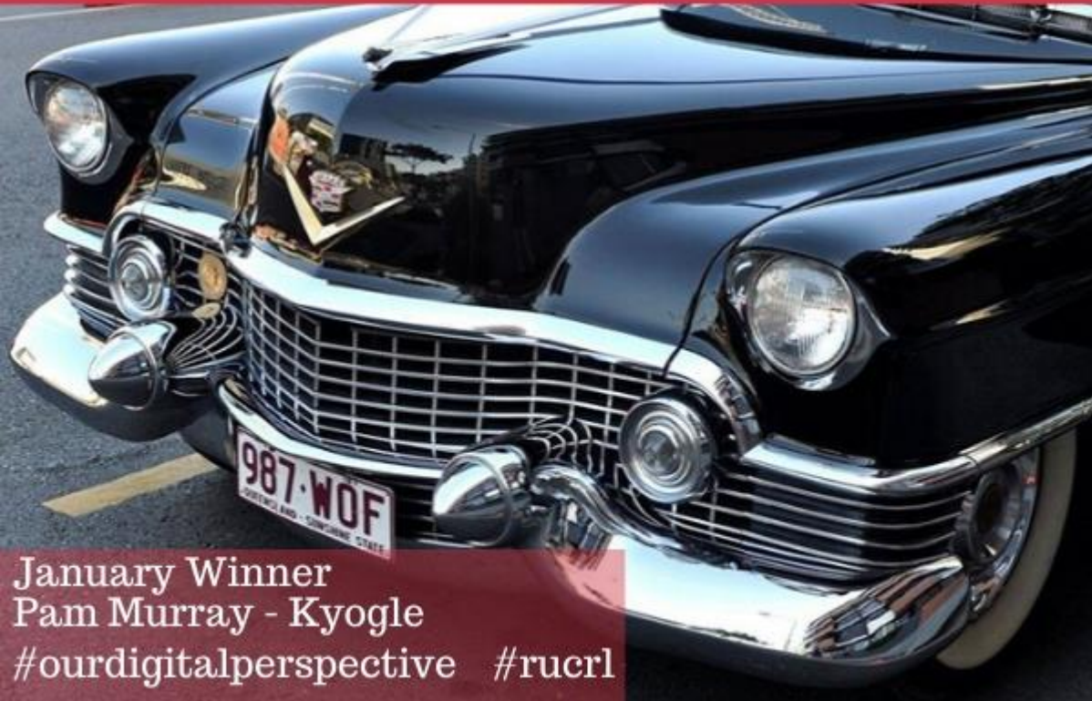
January Winner Pam Murray - Kyogle #ourdigitalperspective #rucrl

Voting will take place the following week on our Facebook page at facebook.com/rucrlibrary