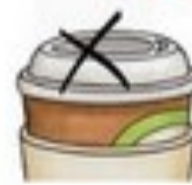
COFFEE LIDS OR PODS